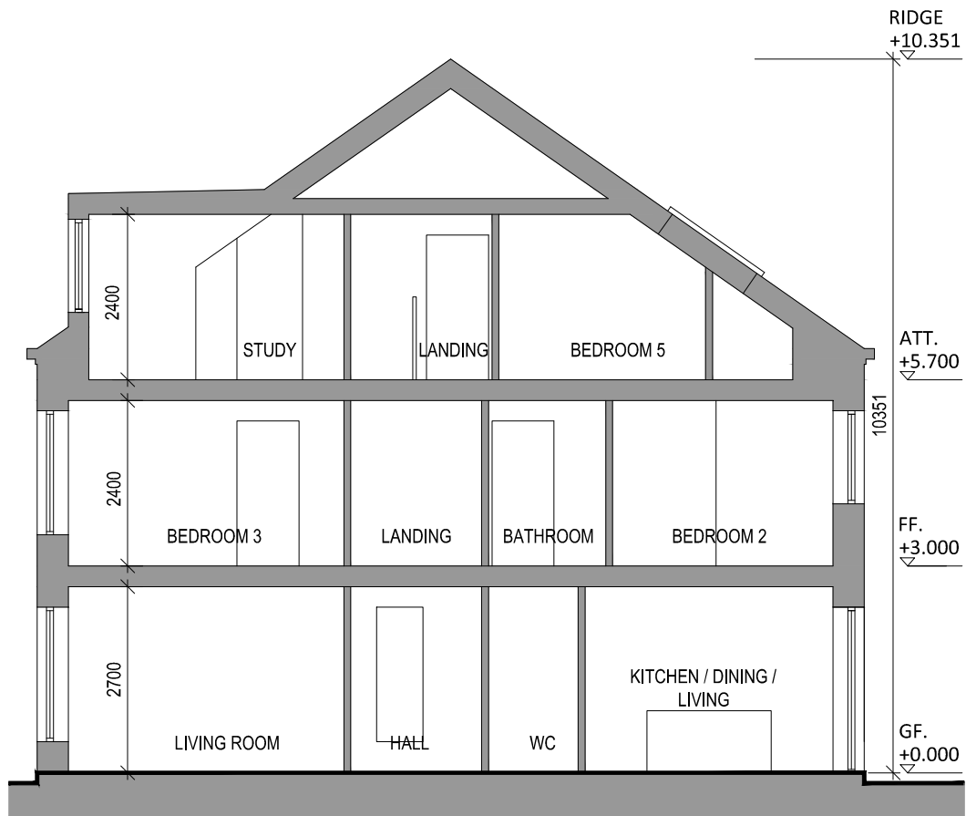
SECTION A-A scale 1:100