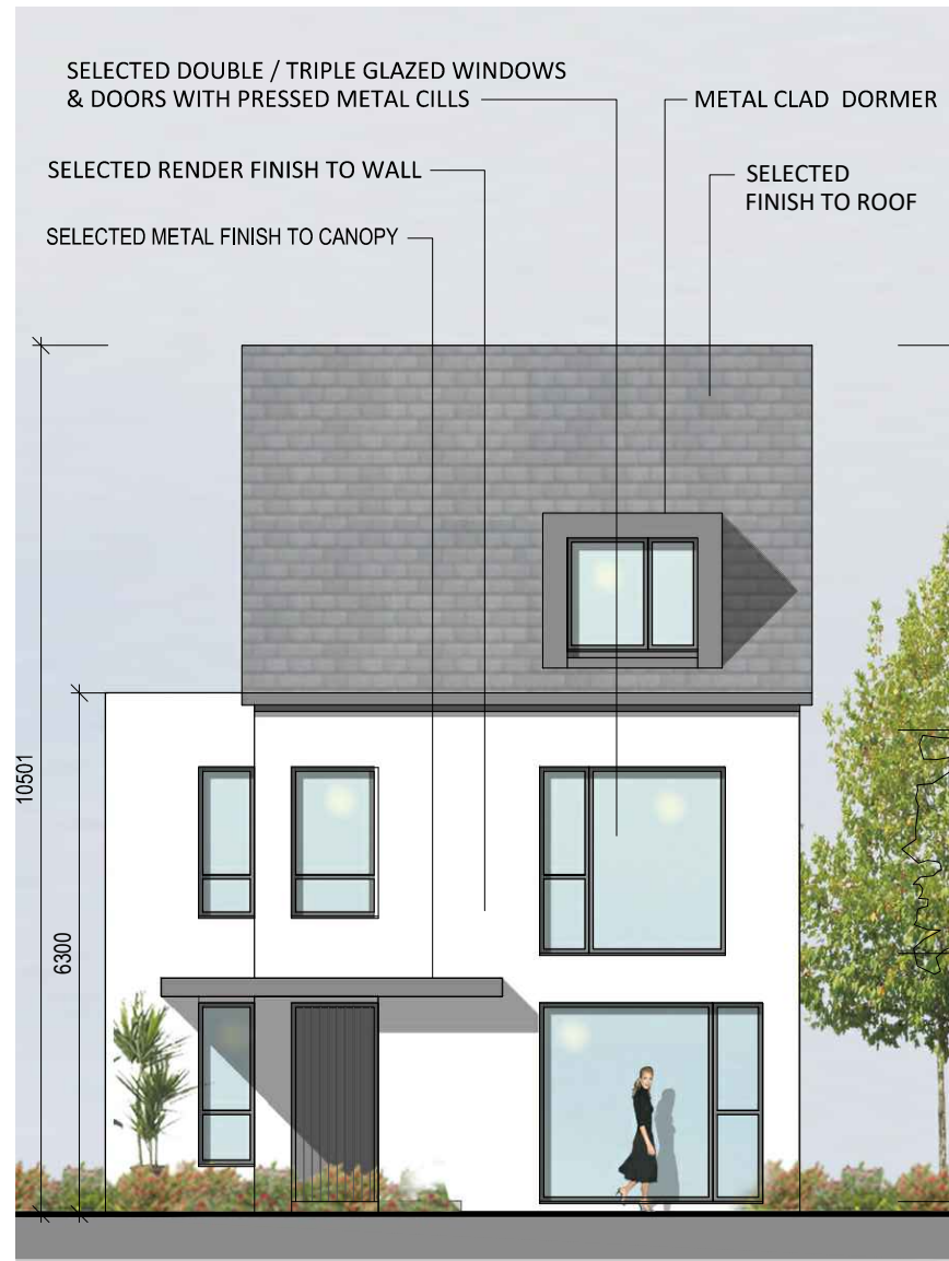
FRONT ELEVATION scale 1:100